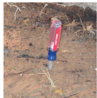
Wet soil after watering