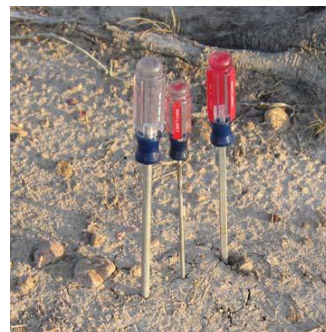
Dry soil before watering