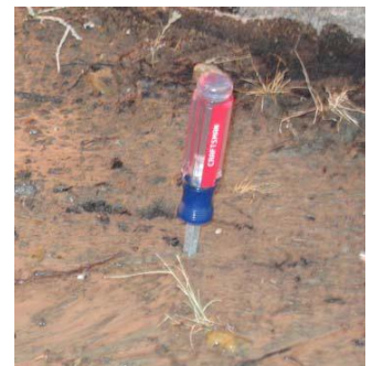
Wet soil after watering