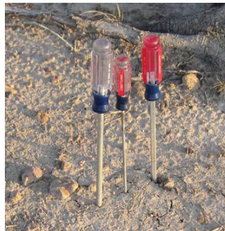
Dry soil before watering